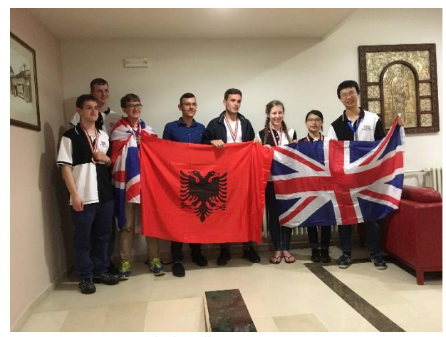
Figure 14 Picture with the Albanians

up to the room. Fortunately, an Albanian walked back to our hotel with us as we didn't really know the way around the outside because we couldn't go through the hotels due to a wedding going on. The Albanians had a 3-hour coach journey back so didn't have to get up until 10 o'clock in the morning but our coach was due to leave at 6:30 so we had to go back and pack. By the time Yuta, Thomas and I had finished packing and chatting we checked the time and realised it had already gone 2 in the morning. This wasn't our most sensible idea given that we had to get up at quarter to 6 the following morning but we would have plenty of time to sleep on the coach and plane journeys.