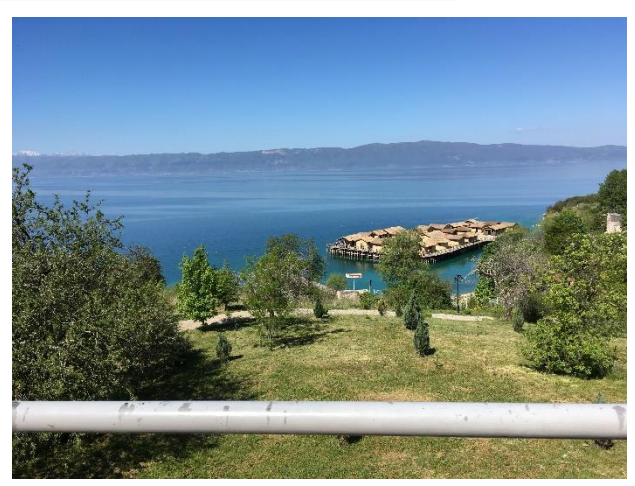
Figure 4 Bay of the Bones

After returning to the hotel we had lunch and then started playing some of our newly learnt card games to try and pass the time. Thomas had come up with a slightly ridiculous rule for Mao<sup>2</sup> which