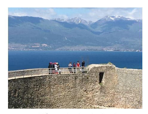
Figure 8 Old fort with Lake Ohrid in the background

but you could still see some of the original foundations and mosaics from the buildings. Also, there was a very impressive church. We discovered the church had been destroyed during the Ottoman empire and only the foundations remained so the church there today was in fact an architect's impression of what the original church would have looked like. All the same, it was a very impressive building. We finished by going into a traditional paper shop on our way back into town where they make paper using the same machines they used hundreds of years ago. The shop is one of only two in the world still preserving these historical techniques. This also was an opportunity there to buy souvenirs to take home which some of us took advantage of.