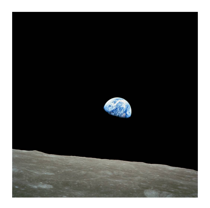
Figure 1: Earthrise as seen from the moon: one tiny delicate Jewel in the vastness of space.

This world has a finite amount of resources and our population is growing. The existing population desires to consume more resources as the billions in the developing world strive to have lives more like those of people in the USA. However it is not possible for people who live in the USA to continue to live like this. We just don't have enough habitable planets for everyone to live like the USA. We would need 5 planets with our current population. Population is expected to peak at 9 billion which would mean that we needed 6\frac{2}{3} planets. We only have one.