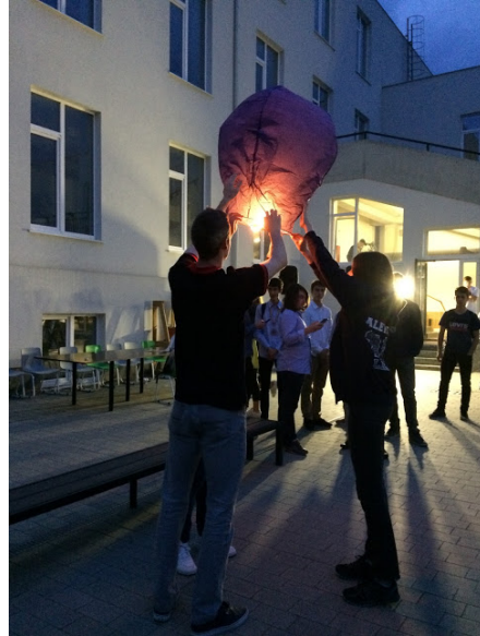
UNK Air's maiden flight