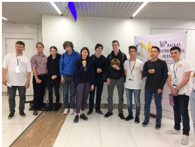
The UK's mascots did not survive for long after this picture.