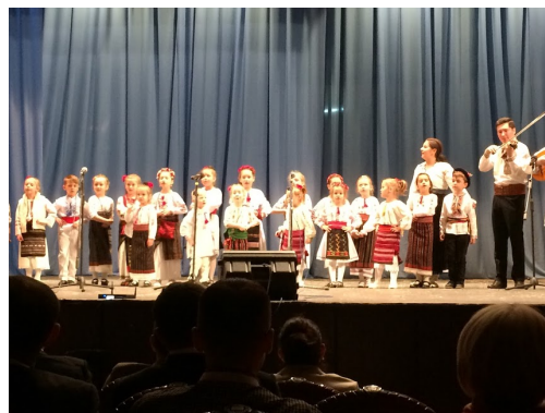
The youngest stars of the opening ceremony